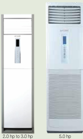
2.0 hp to 3.0 hp